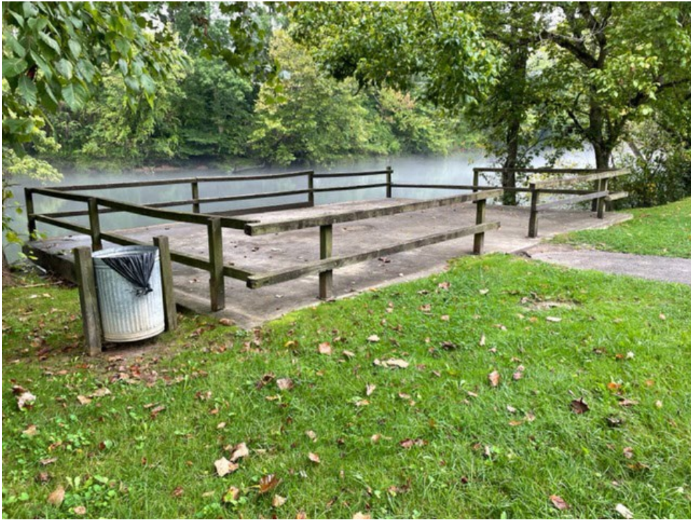
Sidewalk/Ramp to be reconstructed